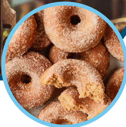
APPLE CIDER DONUTS Recipe On Page 11